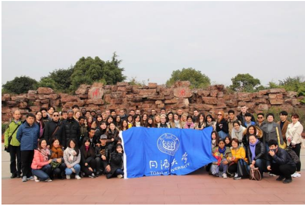
Tongji's Family Group Photos