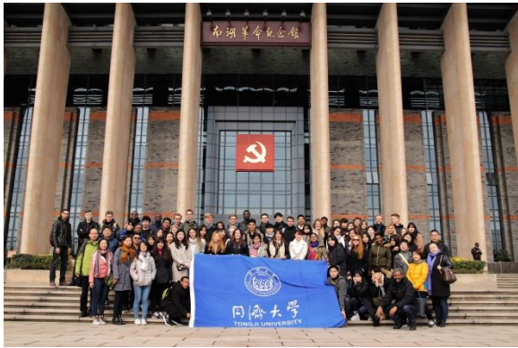
A group photo in front of Nanhu Revolutionary Memorial Hall, Jiaxing.