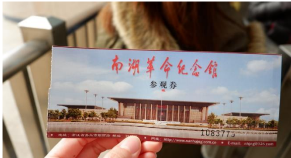
Got a ticket “Nanhu Revolutionary Memorial Hall” (Free entry)

Another stop was made at First National Congress of CPC memorial boat (The Red Boat). We had Visited memorial Hall of Nanhu.