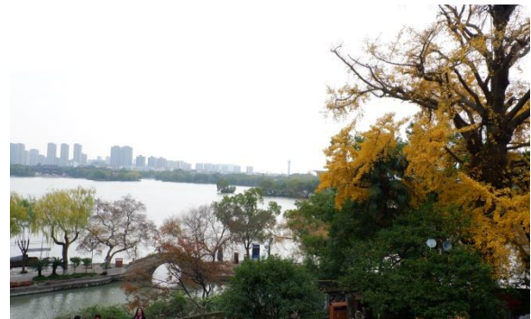
Landscape from Yanyu Pavilion

As we arrived there, we had been to Huijing garden, took the boat to the Huxin Island (Mis-lake Island), then visit Misty Drizzle Pavillion, the most important spot and we have seen nice view of Mis-lake Island from the second floors of Yanyu Pavilion and autumn is here so we can see every leaf is became a yellow flower, which is so beautiful. It's nice to take pictures.