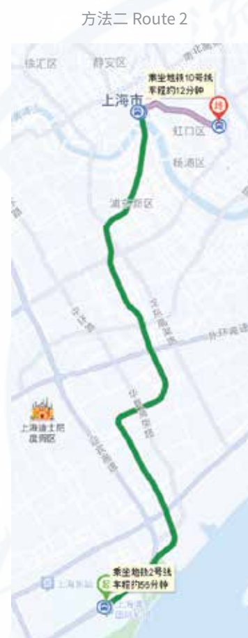
浦东国际机场 - 同济大学四平校区 Pudong International Airport to Tongji University Siping Campus