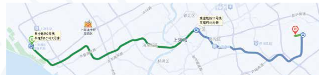
方法一 Route 1