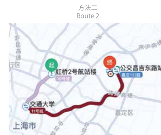
方法二 Route 2