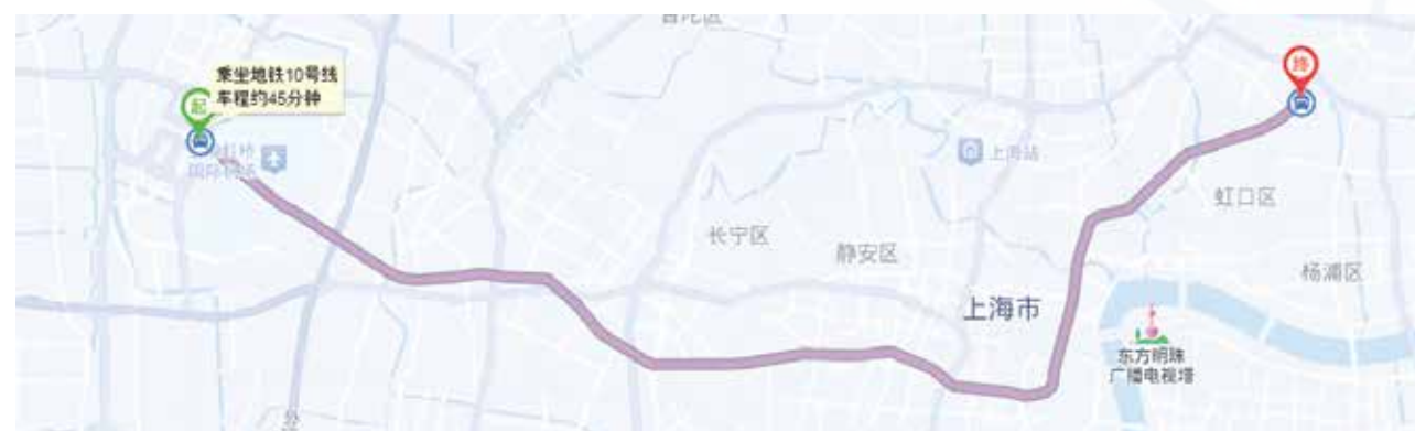
方法二 Route 2