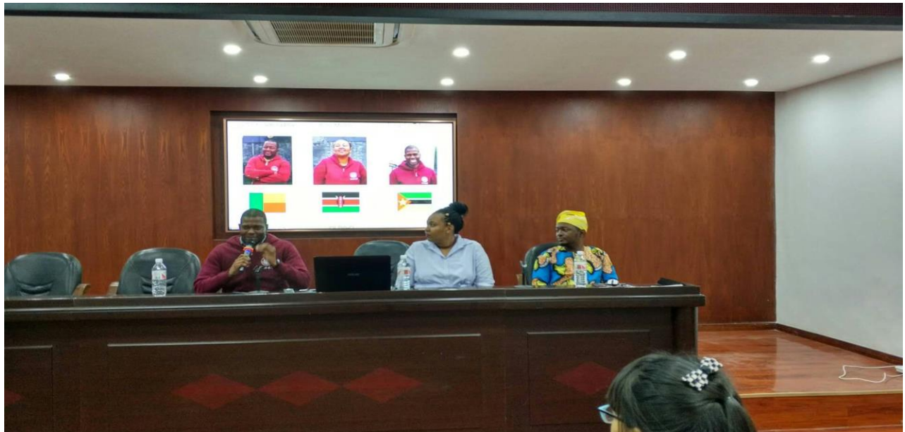
SECOND LECTURE FOR HIGH MIDDLE SCHOOL STUDENTS