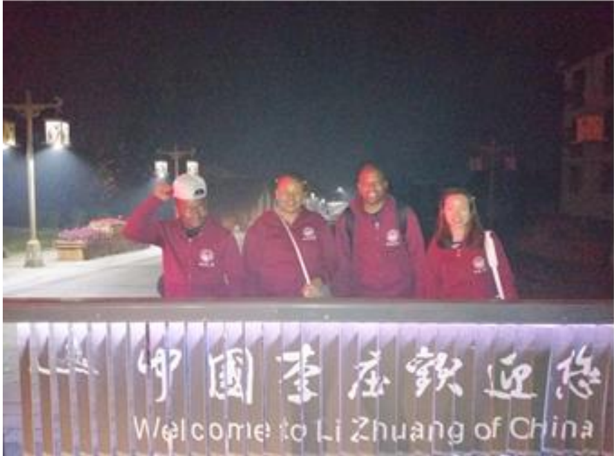
ARRIVAL Nov 6th MU5267 19:15 YIBIN