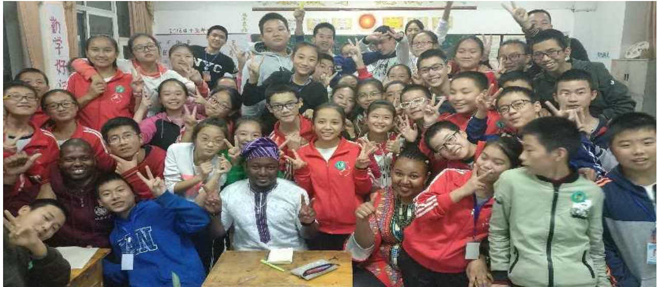
FIRST LECTURE FOR JUNIOR MIDDLE SCHOOL STUDENTS