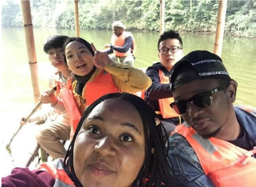
BAMBOO SEA VISIT