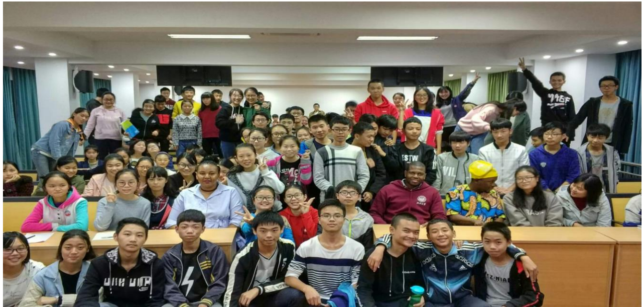
SECOND LECTURE FOR HIGH MIDDLE SCHOOL STUDENTS