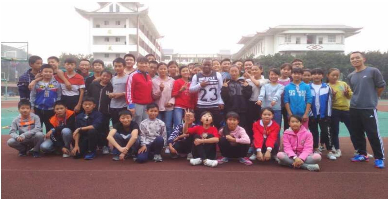
GROUP PHOTO AFTER CLASS