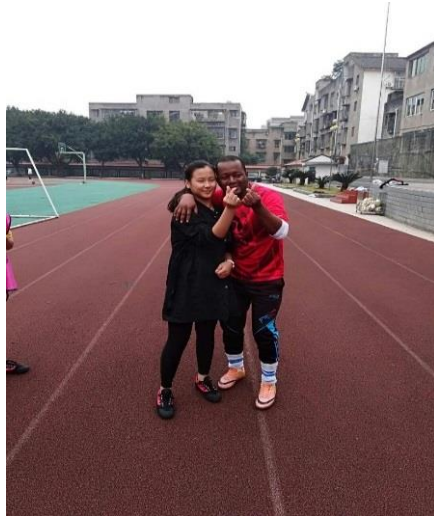
PHOTO AFTER CLASS