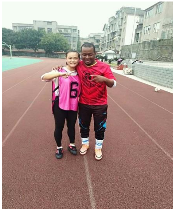
PHOTO AFTER CLASS