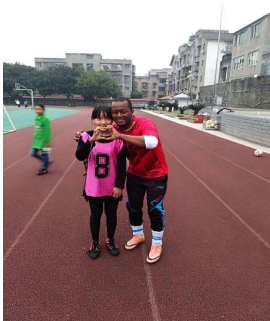
PHOTO AFTER CLASS