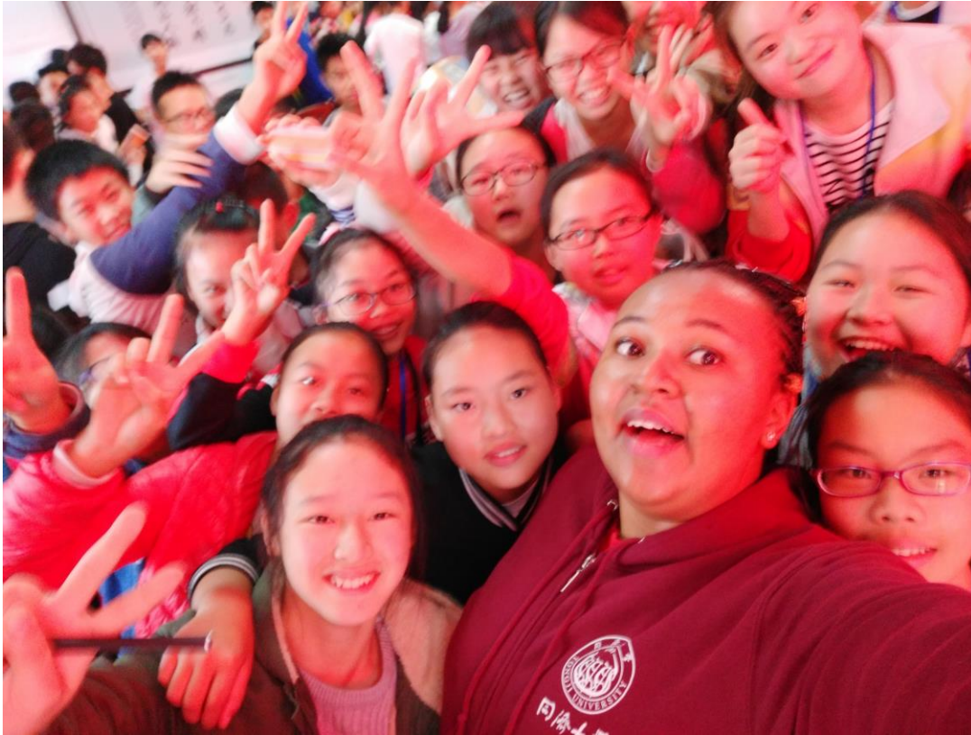
Signing the students books after they met us for the first time