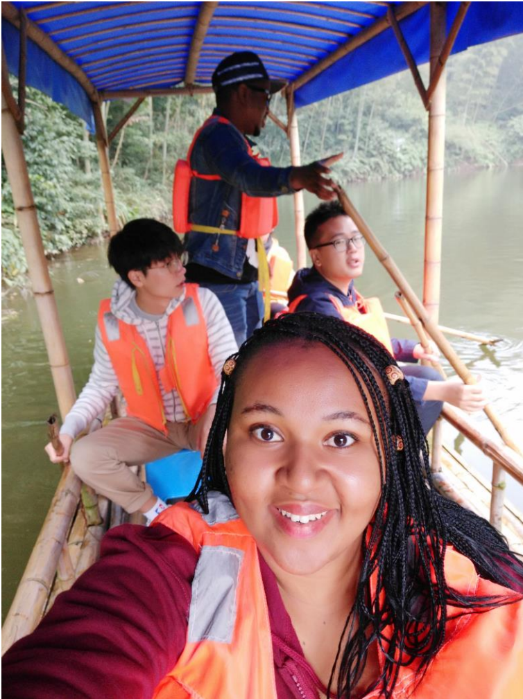
Some photos of the trip we had exploring the area.