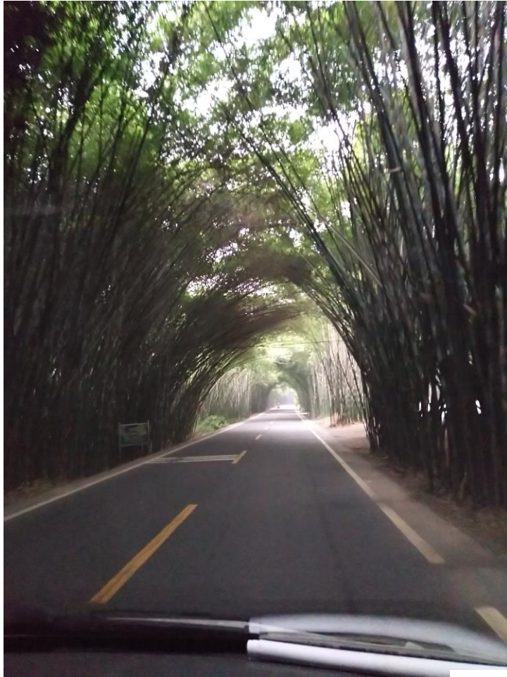
Bamboos form an arch along the road