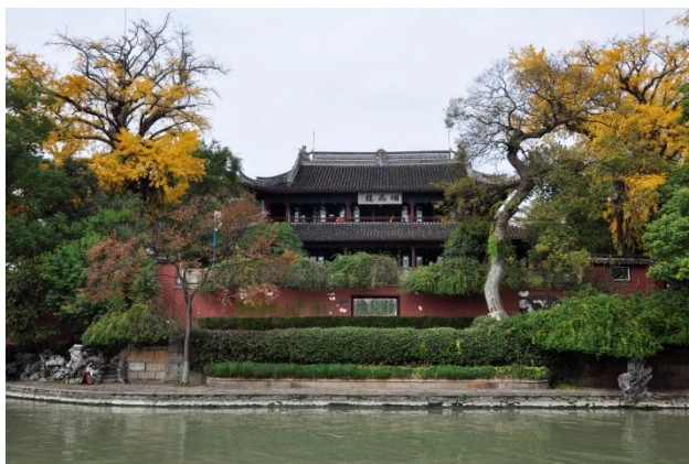
Misty Drizzle Pavilion

Nearby is the impressive Misty Drizzle Pavilion, which is actually a traditional park nowadays, with the winding roads and a scattering of Chinese style houses. One of the most attractive things is the ginkgo trees in front of the pavilion. They are already more than 450 years old. A balcony offers a view over the beautiful Southlake and the opposite lake.