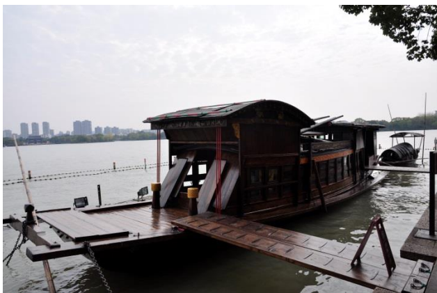
First National Congress of CPC memorial boat

Red Boat, was the Chinese Communist Party founded and the first convention was held.