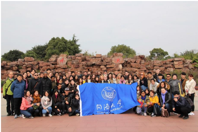
Group photo in front of the South Lake

The tour guide on the bus was very enthusiastic. She started from the history of Shanghai, the origin of the Shanghai city name “HU” and then about the culture of Jiaxing and the political stories that took place there. After nearly two hours of journey, we finally reached the Nanhu area in Jiaxing. This area offers a great variety of interesting destinations to explore.