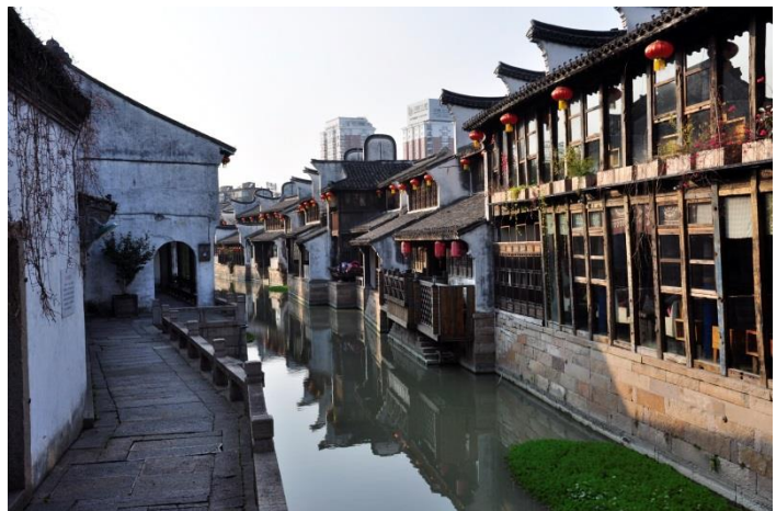
Moon River Block